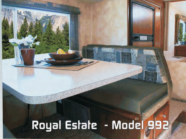
Royal Estate - Model 992

When you compare the specifications of our slide out with the competition, you will see why Arctic Fox continues to be the industry leader. Our full wall slides are up to 26" deep, and our aluminum super structure slide out operates under heavier load conditions than competitors. We build our slide outs right, using dual ram rack and pinion slide mechanisms. Many competitors rely on a single slide mechanism. The dual rams carry the slide-out room smoothly even under full load weights. Five separate seals insure against water intrusion. The slide room is completely insulated for your comfort in all weather conditions. We will continue to lead the industry in innovative slide out camper engineering.