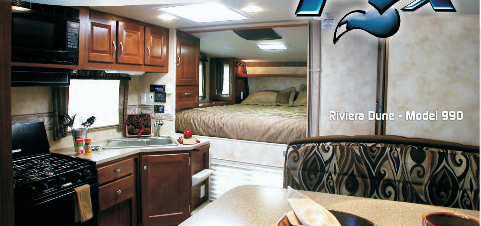
Riviera Dune - Model 990

Northwood is pleased to introduce you to the Arctic Fox Truck Camper. With eight plans to choose from, there is an Arctic Fox to fit the needs of nearly every camper buyer. You can purchase your Fox Camper with confidence because Northwood builds more slide out truck campers than any other manufacturer! Arctic Fox offers a wide variety of features and options sure to satisfy your truck camper needs. That's because The Fox was designed with the informed camper purchaser in mind. We invite you to take a closer look and you'll see why Arctic Fox is the truck camper of choice for the experienced buyer.