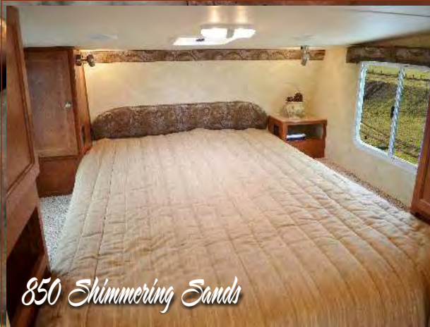
850 Shimmering Sands