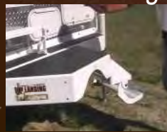
1. Steps in the down position.

Fox Landing is now available on Wolf Creek