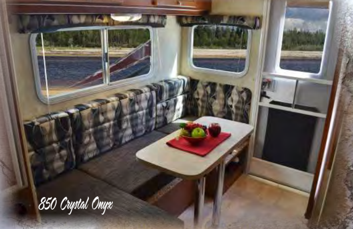
850 Crystal Onyx