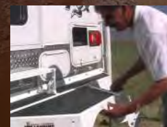
2. Treads fold up...