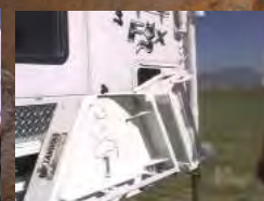
3. ...and locks into place.