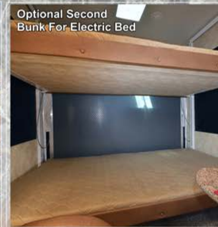
Optional Second Bunk For Electric Bed