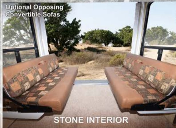
Optional Opposing Convertible Sofas