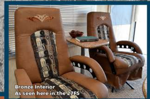
Bronze Interior As seen here in the 27FS