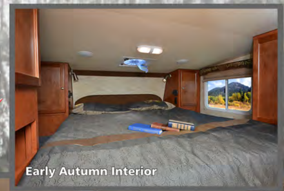
Early Autumn Interior