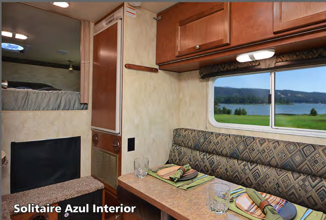
Solitaire Azul Interior