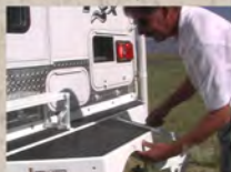
3. Landing folds up, and pin locks it into place