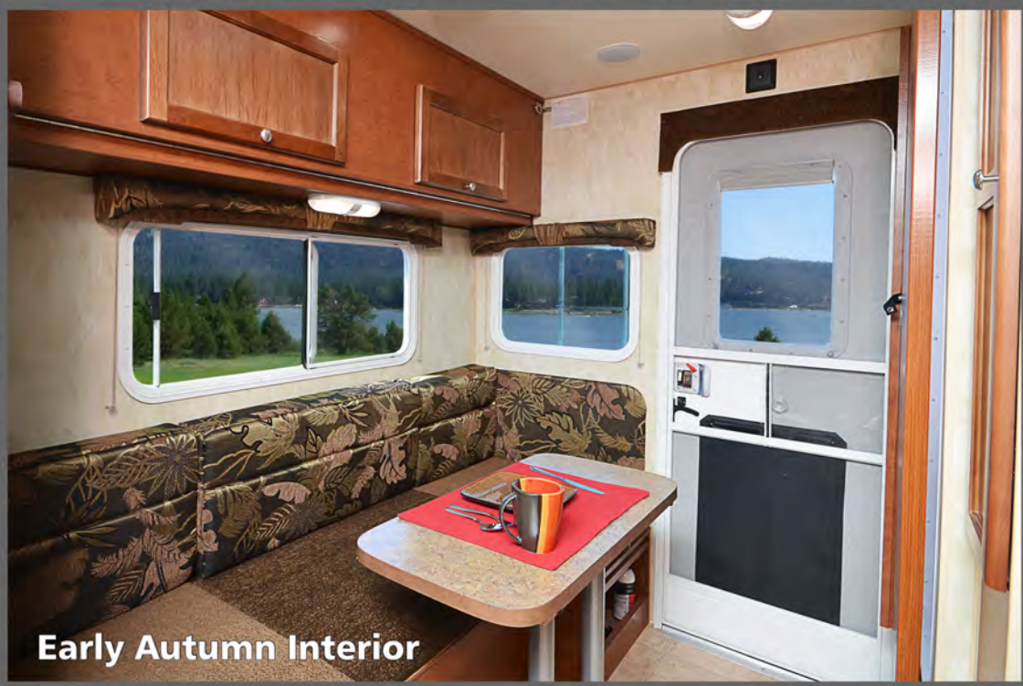
Early Autumn Interior