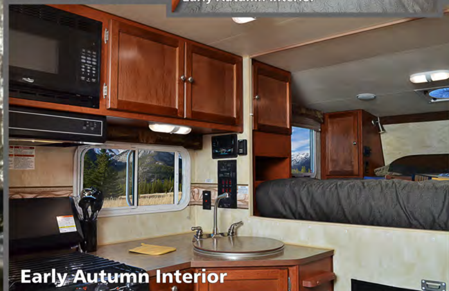
Early Autumn Interior