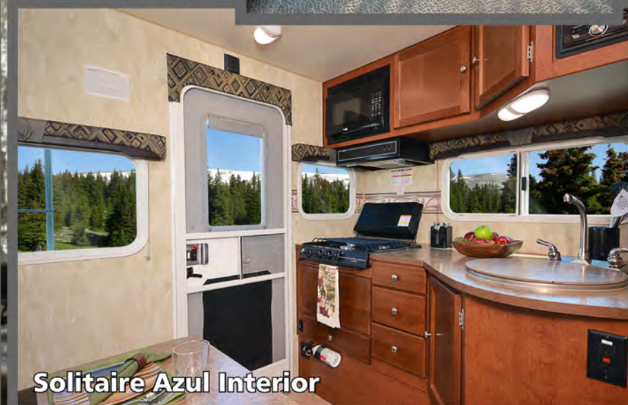
Solitaire Azul Interior