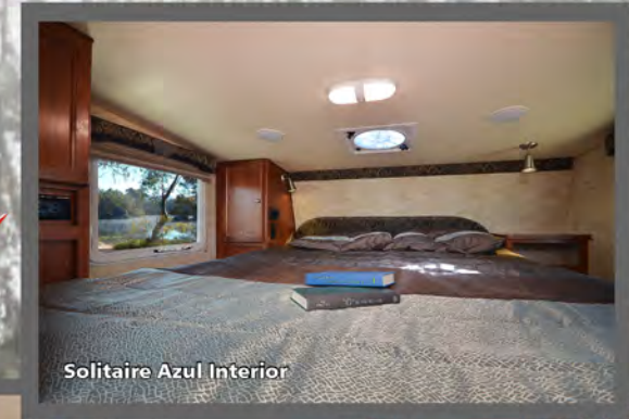
Solitaire Azul Interior