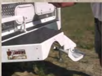
2. Treads fold up....