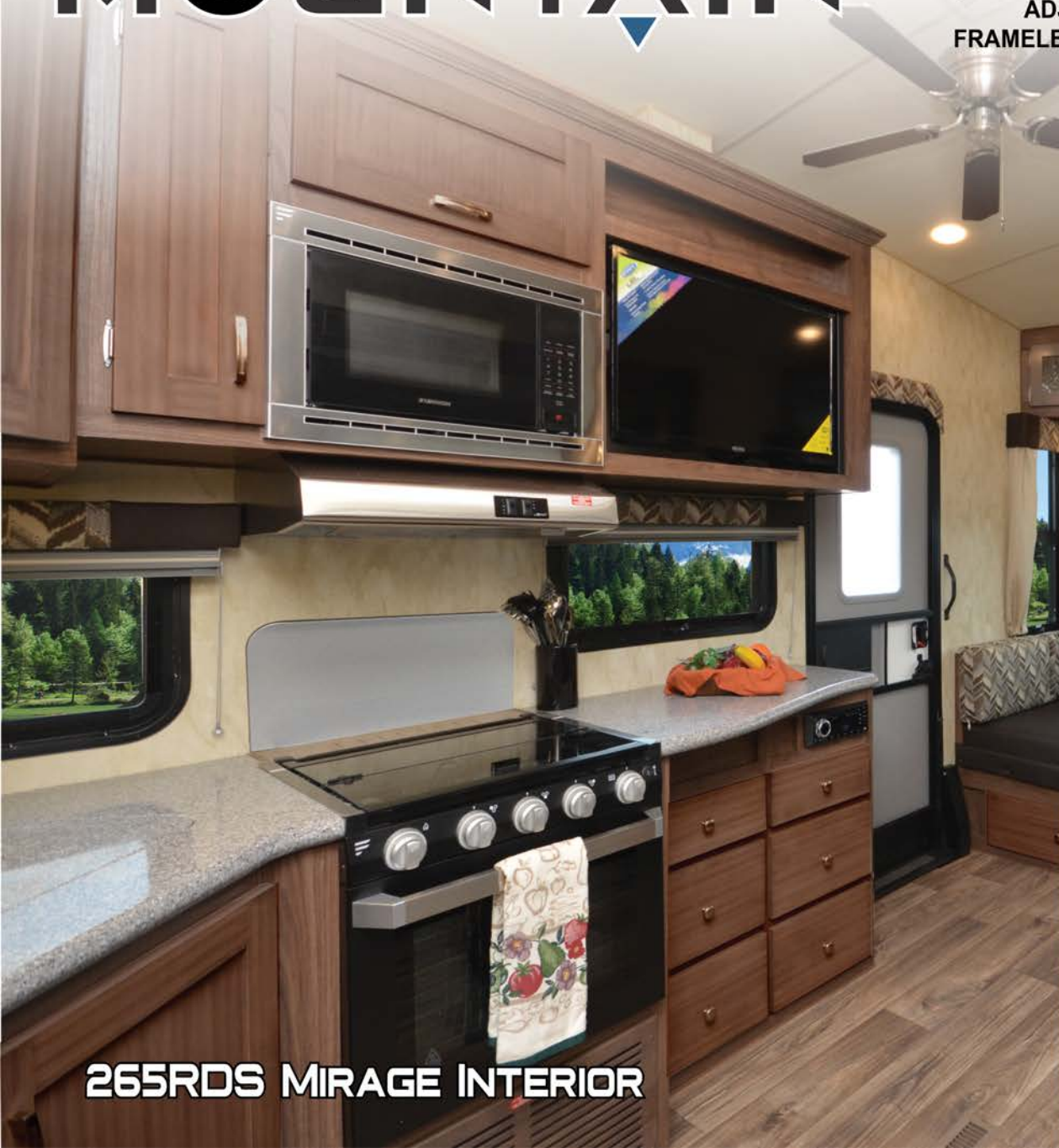
265RDS MIRAGE INTERIOR

NORTHWOOD BUILT, INDEPENDENTLY CERTIFIED, OFF-ROAD CHASSIS GENERATOR READY * CATHEDRAL ARCHED CEILING CONSTRUCTION LED EXTERIOR & INTERIOR LIGHTING * STAINLESS STEEL APPLIANCES FULLY WELDED, THICK-WALL ALUMINUM FRAME CONSTRUCTION SOLID SURFACE COUNTERTOPS * INTERIOR COMMAND CENTER ADJUSTABLE PITCH CAREFREE TRAVEL'R 12V LED AWNING FRAMELESS WINDOWS * 10 CU FT FRIDGE W/ COLD WEATHER KIT MORryde STEP ABOVE ENTRY STEP WITH STRUT ASSIST POWERED DUAL-MOTOR SLIDING STAB JACKS, REAR HIGH DENSITY BLOCK FOAM INSULATION EXTERIOR CONVENIENCE CENTER 12-VOLT POWER LANDING GEAR