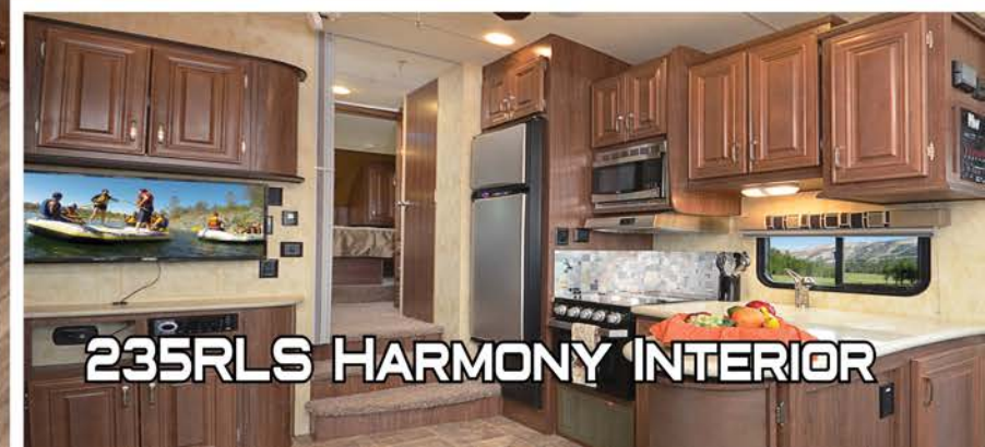
235RLS HARMONY INTERIOR